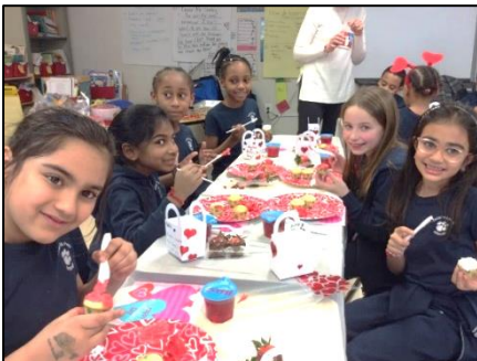
Kids eating snacks at a Valentine's Day party at school

There are many expectations for couples on Valentine's Day. Many people plan things far in advance so that they can enjoy spending time together with their partner. Next Valentine's Day, try to plan something fun with your friends if you can!