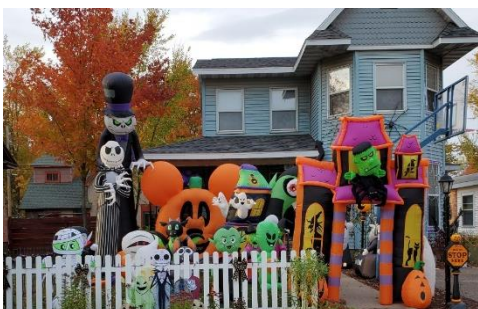
A house in America on Halloween

How do you celebrate birthdays in Japan? Come talk to us about it!