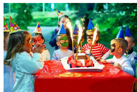
A racecar themed kids' birthday party