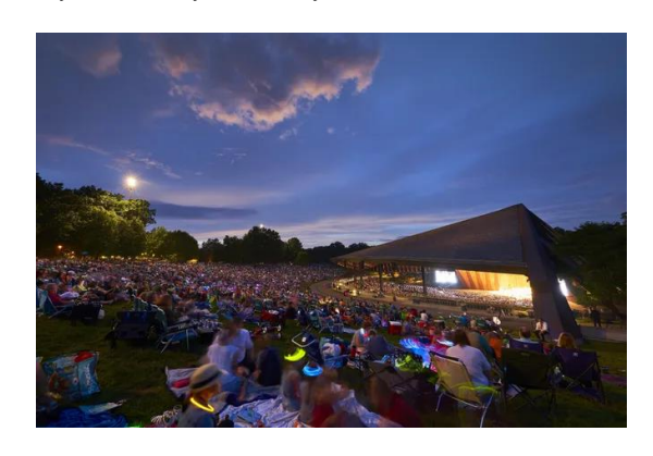
Fourth of July celebration at Blossom Music Center in Ohio

There are many firework festivals and events around July 4<sup>th</sup>, but it is also very popular for people to buy their own fireworks and set them off (花火に 点火する) at their houses! Near my house, there is a firework store that is only open a few days before and a few days after The Fourth of July. They make so much money from this holiday that they are hardly open any other days of the year!