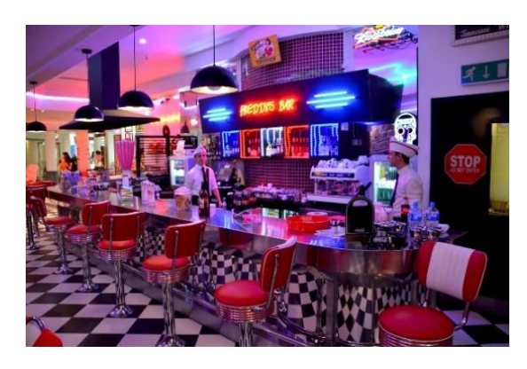
An American diner in 1960s-style architecture

To Americans, diners are a retro place from the past where you can eat delicious food at a cheap price. Diners were popular hangout spots for teenagers, and are still popular today (though maybe a little less). Diners are often the only restaurants open late at night, so I would go with my friends a lot during college when we would study late. If you study abroad in America, try going to an authentic American diner!