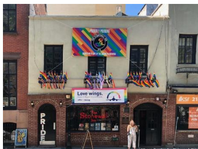
The Stonewall Inn in Greenwich Village, New York City

In 2016, President Obama declared the Stonewall Inn a national monument, and nowadays, many cities across America have Pride Parades in June. Seattle just had their Pride Parade yesterday (June 26 th ) and some of my friends went and posted pictures online. Even though attitudes (態度) towards LGBT people are a lot better now, many people are scared that LGBT rights (and women's rights) are going to be taken away. This is because part of the current government in America is very conservative (保守的), and they may change the laws that currently protect LGBT people. Even today, the fight still continues!