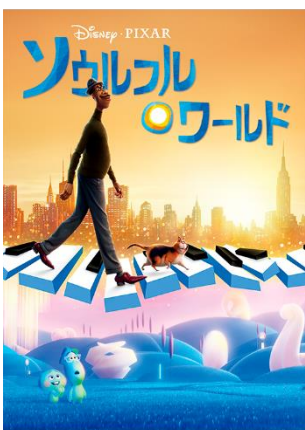
Poster for the Disney movie "Soul"

Nowadays, jazz is everywhere; it's even the music of Charlie Brown & Snoopy! New York City is considered the jazz capital in America. When I hear jazz, I always imagine I'm in New York, either walking through the busy streets or sitting in a café on a rainy day. This impression of jazz can even be seen in the Disney movie "Soul", which is about an African-American jazz music teacher living in New York City. I hope that if you watch this movie, you'll be able to understand and feel the history of jazz. (๐)