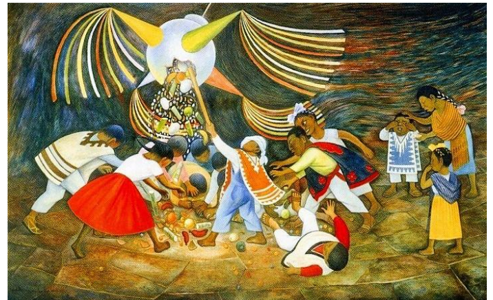
This is a painting named "La Piñata" by Diego Rivera. The children are running to pick up the candy that is falling out of the piñata. You have to be fast in order to get some candy, or else you will end up crying like the kid on the right side...

Christmas is one of my favorite holidays! There is so much to do! There are many ways to celebrate Christmas, but today I want to share with you how I celebrated Christmas as a child. During December, we visit many people and eat delicious home-cooked meals with all of our family (grandparents, aunts, uncles, cousins, etc.). On the days leading up to Christmas, we sometimes have a party with a star-shaped piñata ! All the kids line-up to hit it until it breaks. The piñata has candy inside so, after it breaks, the kids can take the candy that flies out of it. This type of Christmas party is called a posada and it is celebrated by Hispanics and Latinos.