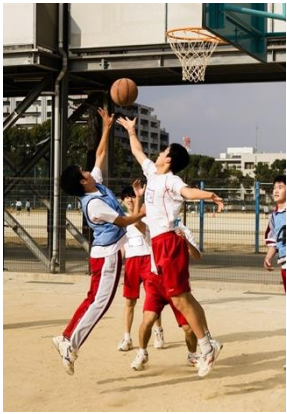
Basketball game between 2 nd -year students during Class Match.

This month, the most exciting event was definitely the Class Match! I really enjoyed watching all of the students playing sports, and I took many pictures. Some of the games were very exciting (especially the final rugby game and the final volleyball game). I hope that you can see the pictures sometime. However, now I am looking forward to winter vacation. Even though I'm not a student, I need a break. What are your plans for Christmas and New Year's?