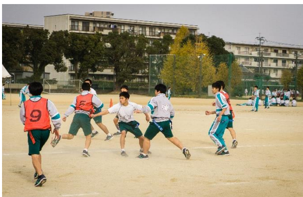
1 st -year students playing a rugby game during the Class Match.

No matter what, I hope that you all have a safe and fun winter vacation. Please try to finish your homework, but also relax and rest. Get ready for the next (and last) school term!