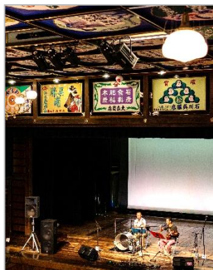
Inside Yachioza, Yamaga City