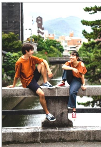
Me posing for Photo Club

In Photography Club, Valeria-sensei and I usually give comments about students' photos, but last month we went on a photo trip! We walked to many places and took many pictures with students. I laughed a lot!