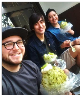
ALT friends eating kakigori

The heat of summer was brutal! But kakigori saved me! In my free time, I enjoy driving around Kumamoto and going to new cafes. This summer, my friends and I